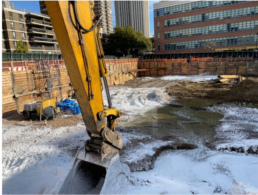
Photo 1: Atmos® AC-645 dust/vapor suppressing foam applied to exposed soil/fill for the temporary overnight cover (facing northeast)