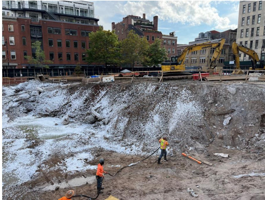
Photo 1: CCJV applying Atmos® AC-645 dust/vapor suppressing foam to exposed soil/fill for the temporary overnight cover (facing southwest)