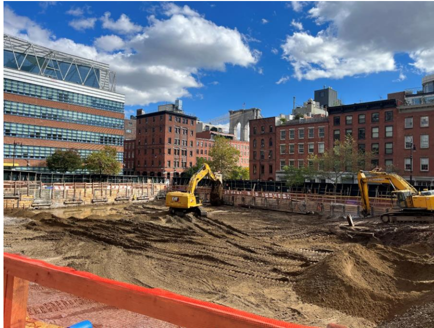
Photo 1: CCJV using imported general fill for backfilling activities in the southeastern part of the site (facing southeast)