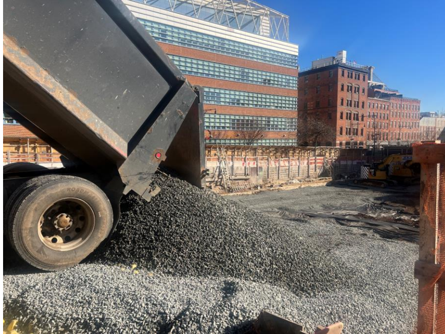
Photo 1: ECD importing 0.75-inch virgin stone for installation of a temporary site cover (facing southeast)