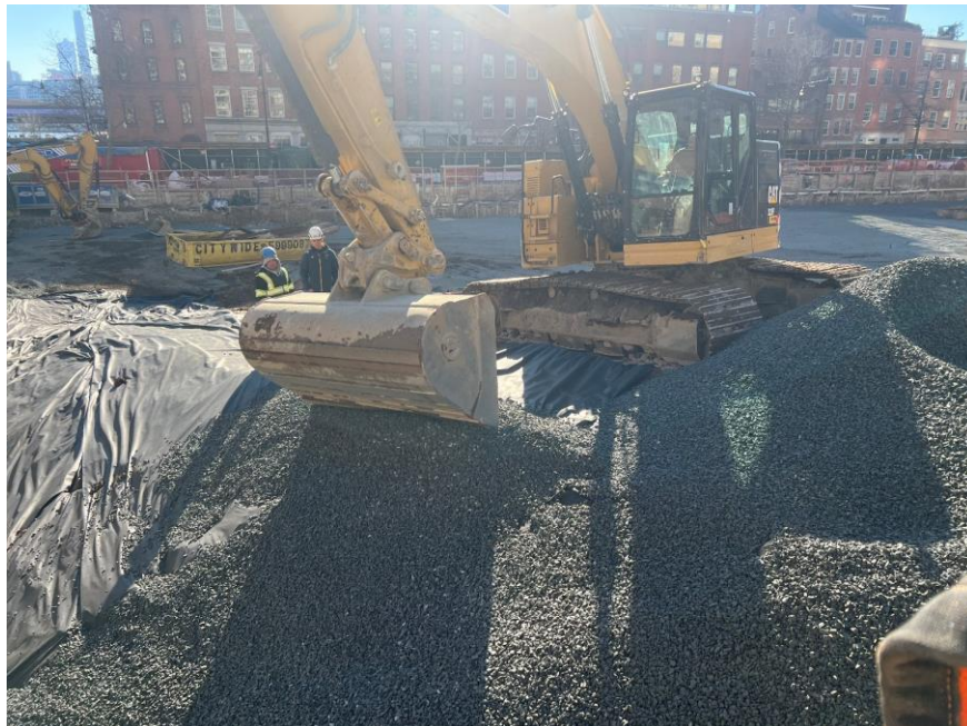
Photo 2: ECD backfilling the northeast part of the site with imported 0.75-inch virgin stone (facing south)