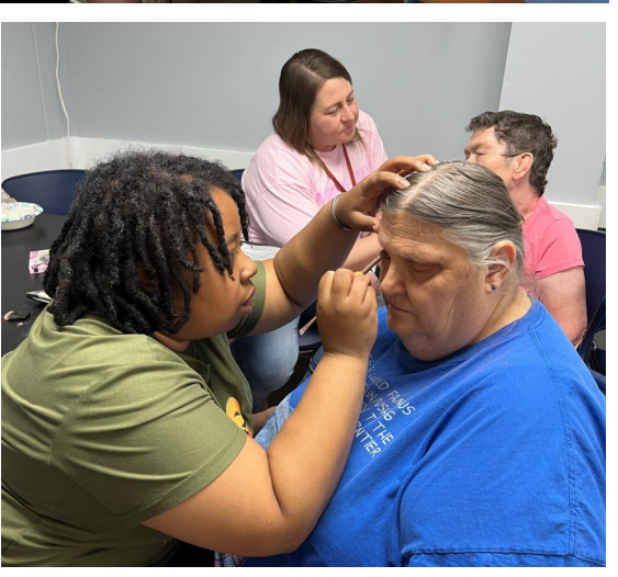
This Is So Much Fun