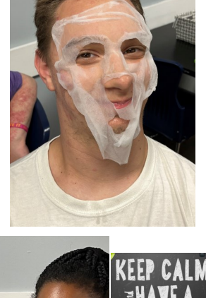
KEEP CALM #HAVE A SPA DAY