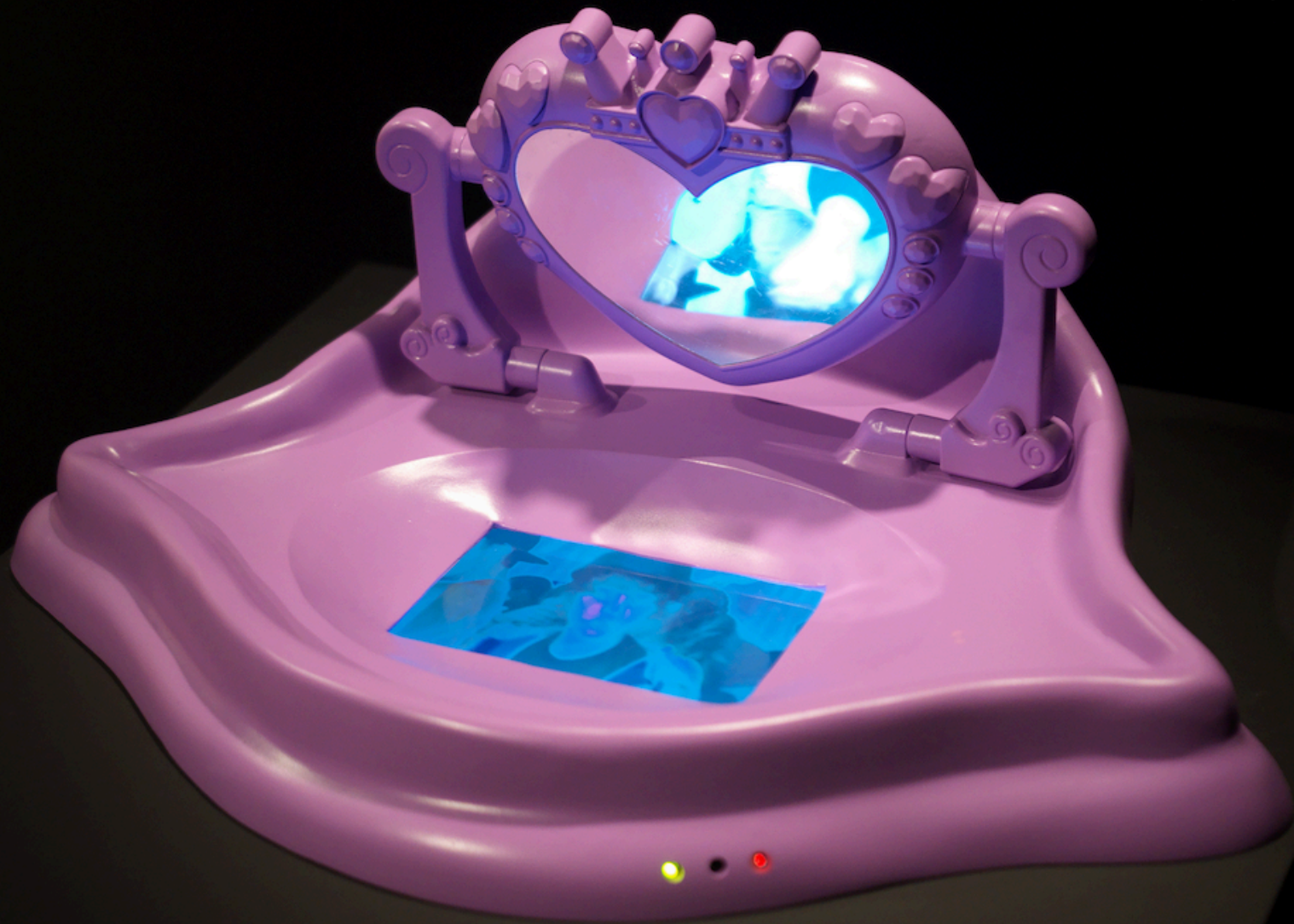
Vanity , 2026 Epoxy clay, found plastic, acrylic, video monitor 11 x 24 x 16 inch