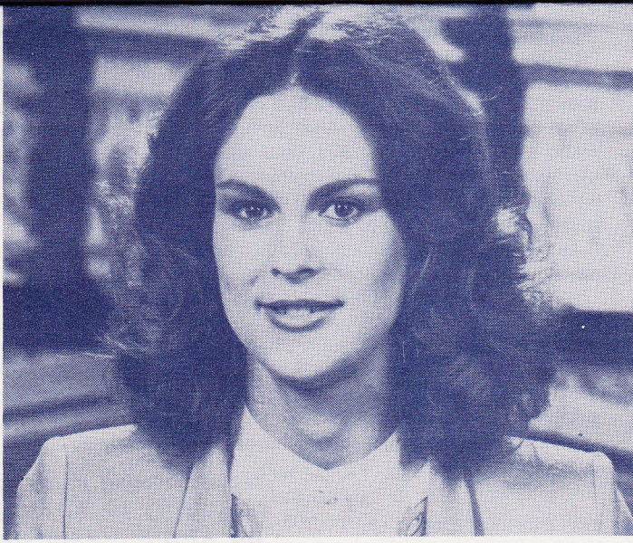
Christie Hefner to speak October 1. See page 1.