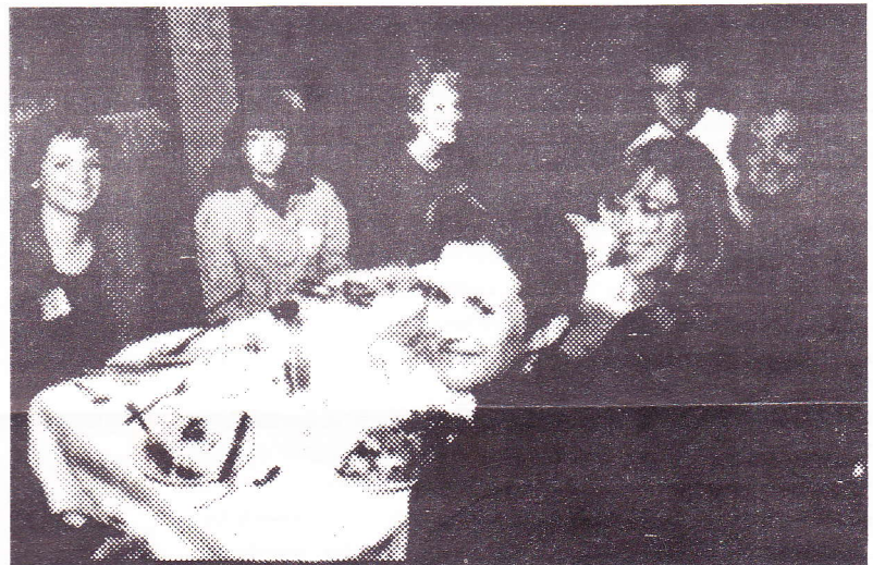
Members share personal and professional experiences at the 1989 UCWBG Networking Dinner.