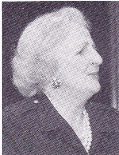
Letitia Baldrige discusses ethical behavior in the business world with UCWBG members and guests.