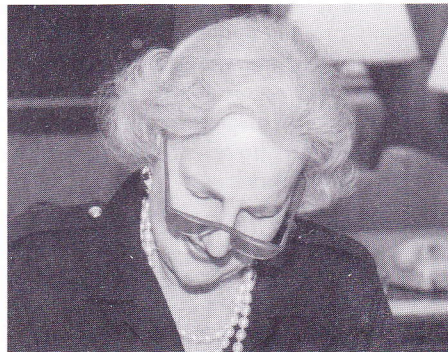
Ms. Baldrige graciously autographs a copy of one of her books for a member.

After answering many audience questions, Ms. Baldrige autographed copies of three of her books: Letitia Baldrige's Complete Guide to Executive Manners , Letitia Baldrige's Complete Guide to the New Manners for the '90s , and her novel, Public Relations, Private Affairs . ☞