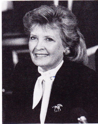
Martha Layne Collins

Ms. Collins, who sits on R.R. Donnelley's board of directors, initiated this event when she expressed an interest