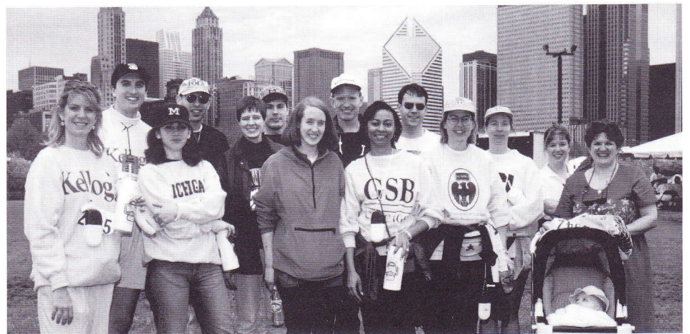
Alumni from the University of Chicago, Kellogg, and the University of Michigan gather to participate in the Walk & Roll Chicago to benefit the American Cancer Society.

The excitement is already building for next year. Thanks again for coming out and supporting a good cause!