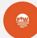
FEEL THE WARMTH