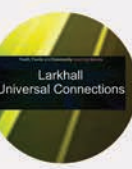
LARKHALL UNIVERSAL CONNECTIONS