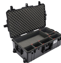
1615TP With TrekPak Divider System