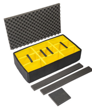
1615AirDS Padded Divider Set