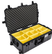
1615WD With Padded Dividers