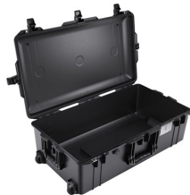
1615NF No Foam