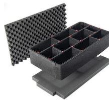
1615TPKIT TrekPak Case Divider Kit