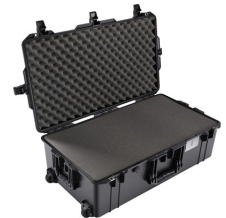
1615WF With Foam