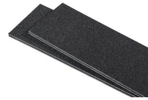
1615TPDIV Extra TrekPak Dividers