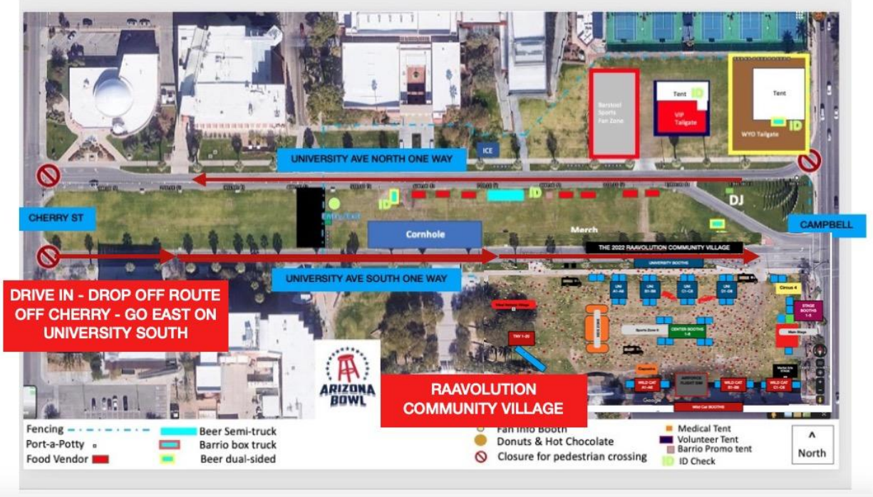
AZBOWL Festival and Stadium Parade Map