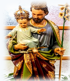
National Shrine of St. Joseph De Pere, WI