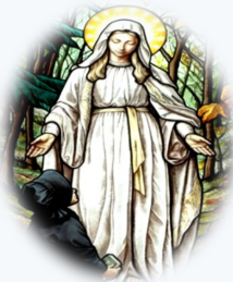
Our Lady of Champion Champion, WI

or email: Sacredheartpilgrimage2026@outlook.com