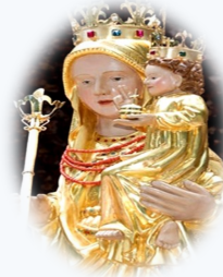
Our Lady of Ludźmier Carmelite Shrine, Munster, IN