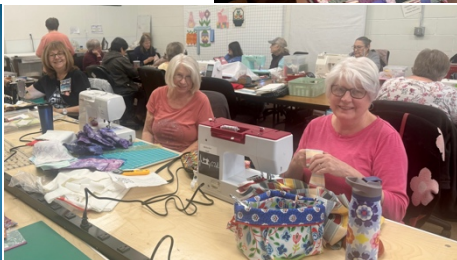
LNCQ Members sewing tops for charity quilts at the Community Sew Day