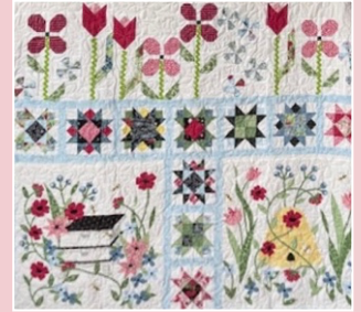
Spring quilt

A: Try trapunto! Add an extra layer of batting behind select motifs before quilting. After quilting around those shapes, trim away the excess batting from the back, then layer and quilt as usual. The raised effect adds beautiful texture.