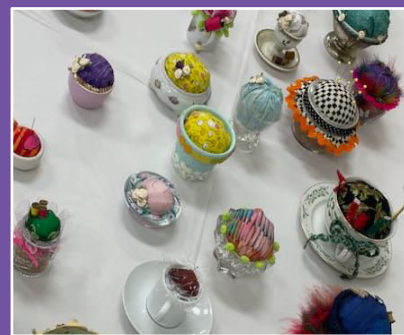
Top: Pincushions created by members at the workshop