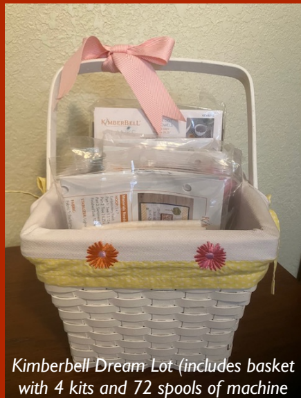
Kimberbell Dream Lot (includes basket with 4 kits and 72 spools of machine embroidery thread (not pictured) Valued at $440 Opening bid $150

Join us for a festive afternoon of fun, food, and friendship at the annual LNCQ Holiday Party!