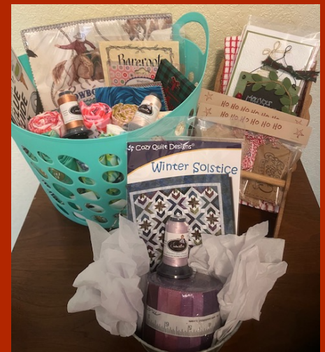
Clockwise from top left: Wild Oats Basket Valued at $200, Opening bid $75