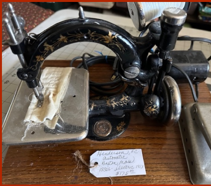
Antique Sewing Machine Valued at $175 Opening bid $75