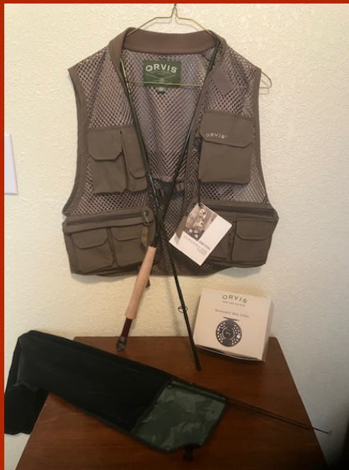
Fly Fishing Equipment (rod, reel, and ladies vest). Valued at $470. Opening bid $200.

Come enjoy an afternoon of laughter, inspiration, and generosity—this is one you won't want to miss!