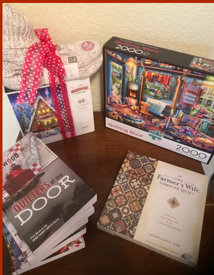
Quilty Puzzles and Book Items Valued $28-$60 Opening Bids $10-20