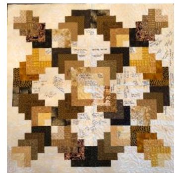
Signature quilt for a Purdue retiree