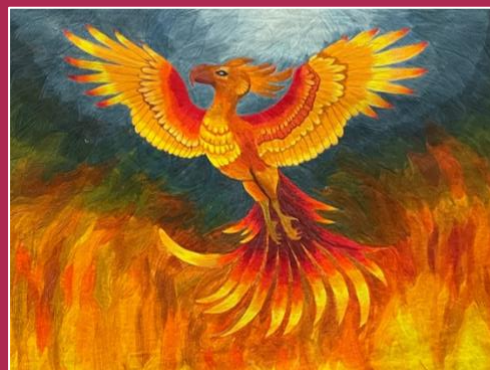
Linda Salitrynski's Phoenix Quilt

As tax season approaches, LNCQ has completed its 2024 tax filing. While we don't pay taxes as a nonprofit,