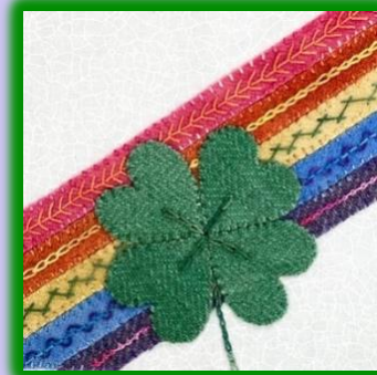
Shamrock & Rainbow Wool Applique block

Create a rainbow or green-themed quilt or block for March—bonus if you incorporate an Irish Chain pattern!! Send a photo to newsletter.lncq1996@gmail.com for a chance to have your project featured next month!