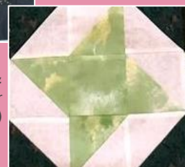
Heart block (top) & Friendship Star block (right)

Submit your quilty questions to newsletter.lncq1996@gmail.com