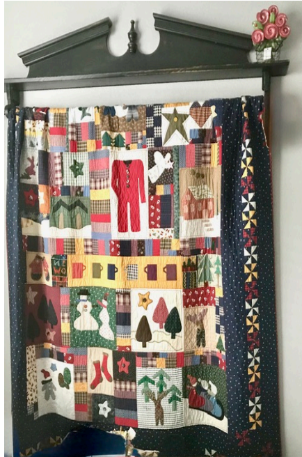
Winter Quilt