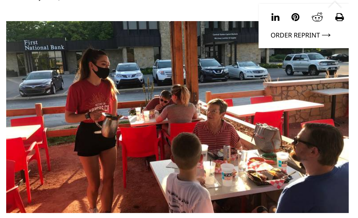
The patio at the Taco Republic in Prairie Village. File photo