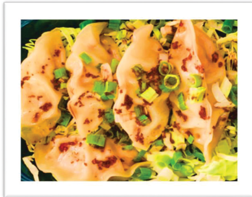
Pork Dumplings (6) (Pan-seared to perfection!)