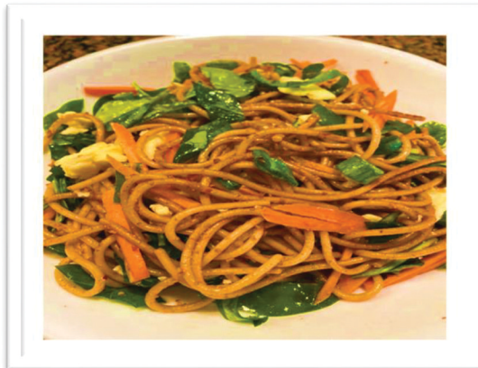
Mee Goreng - Veg (Malaysian Fried Noodles)