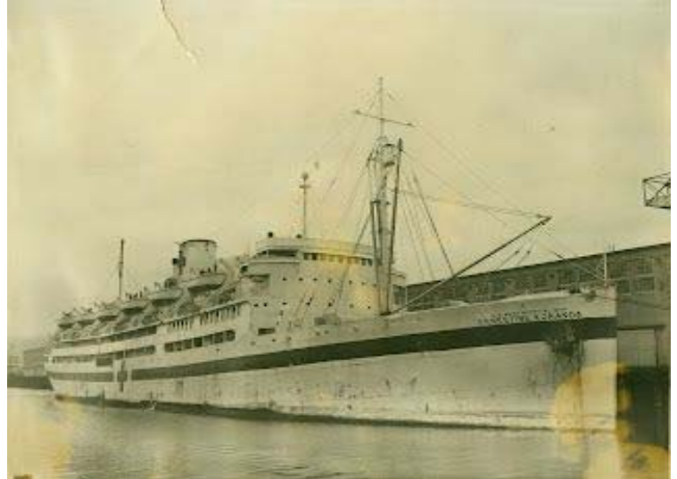
Photo: Hospital Ship USAHS Ernestine Koranda