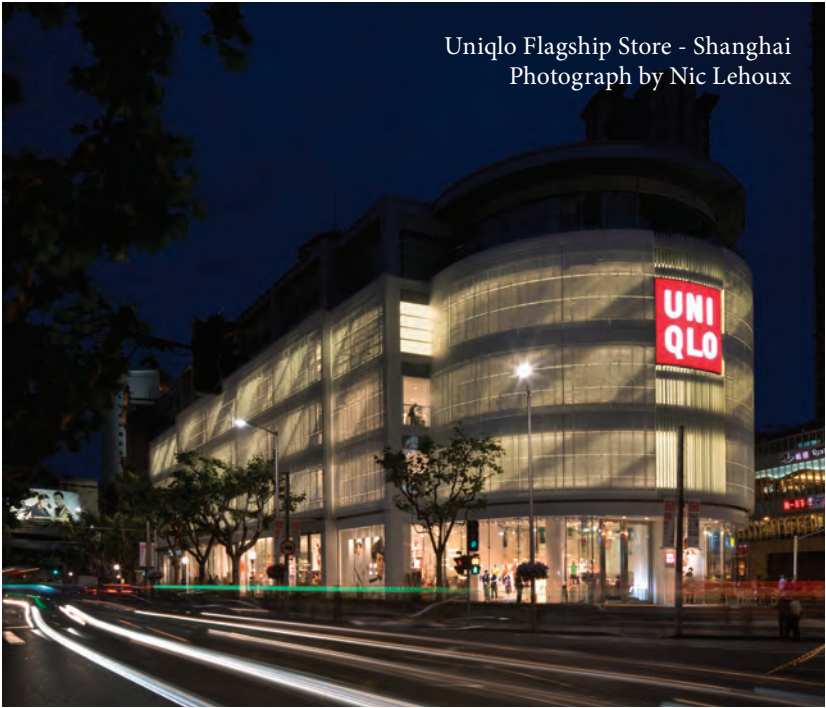
Uniqlo Flagship Store - Shanghai