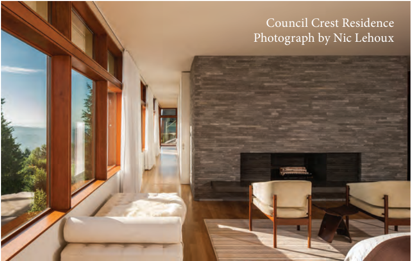
Council Crest Residence