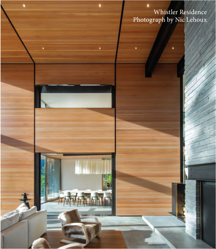
Whistler Residence