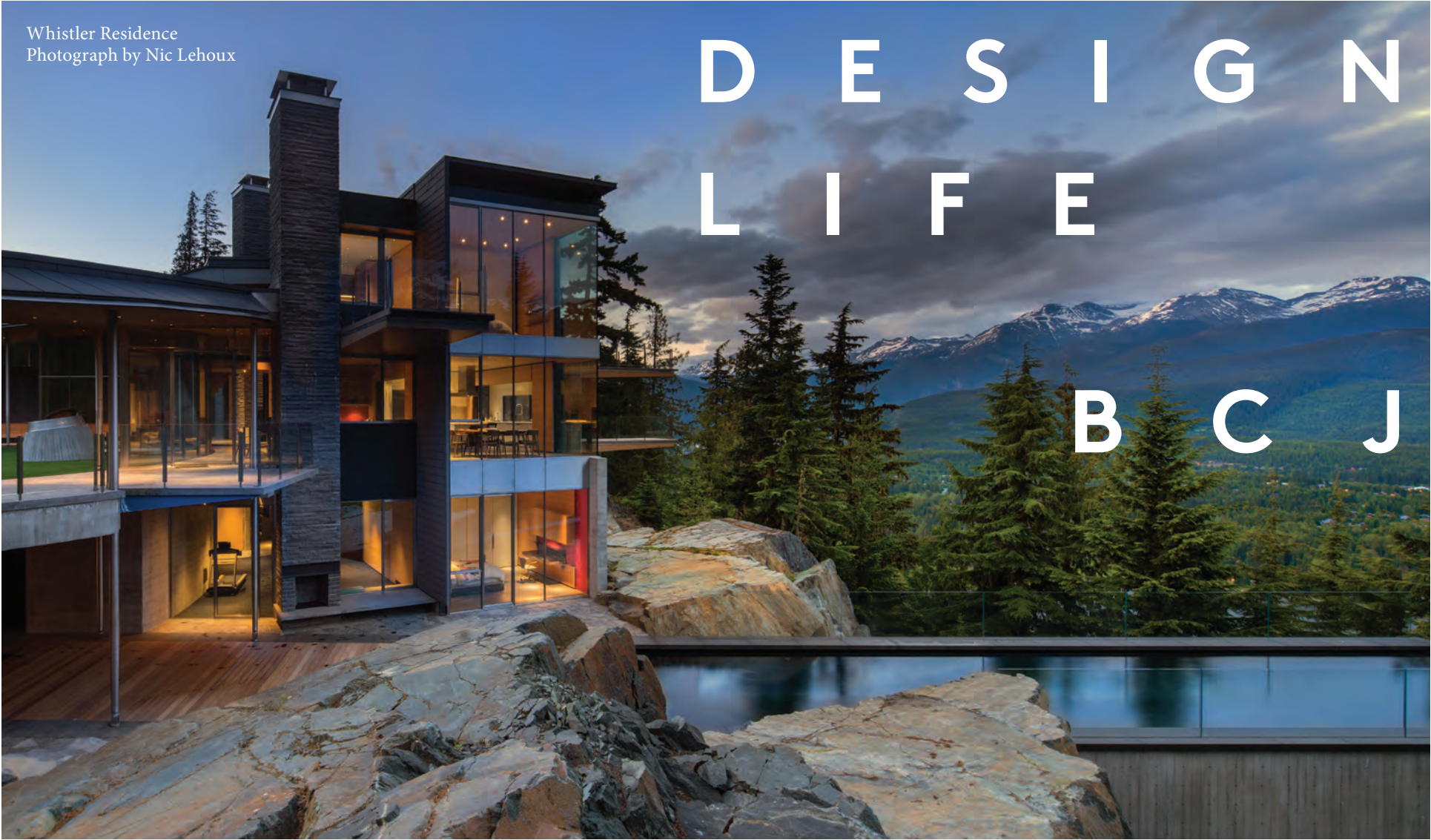
Whistler Residence