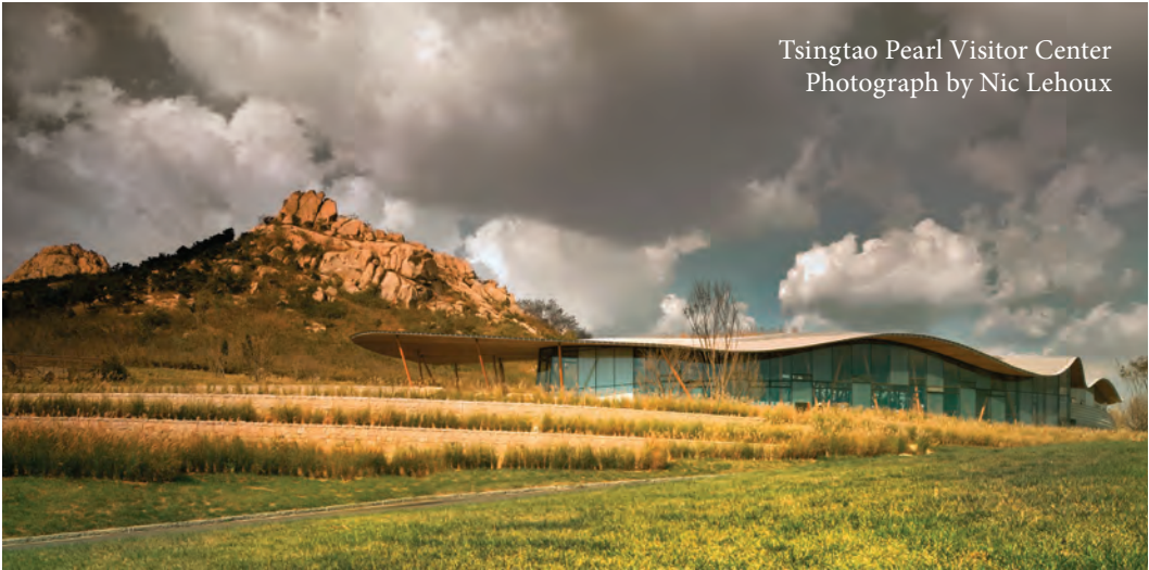
Tsingtao Pearl Visitor Center