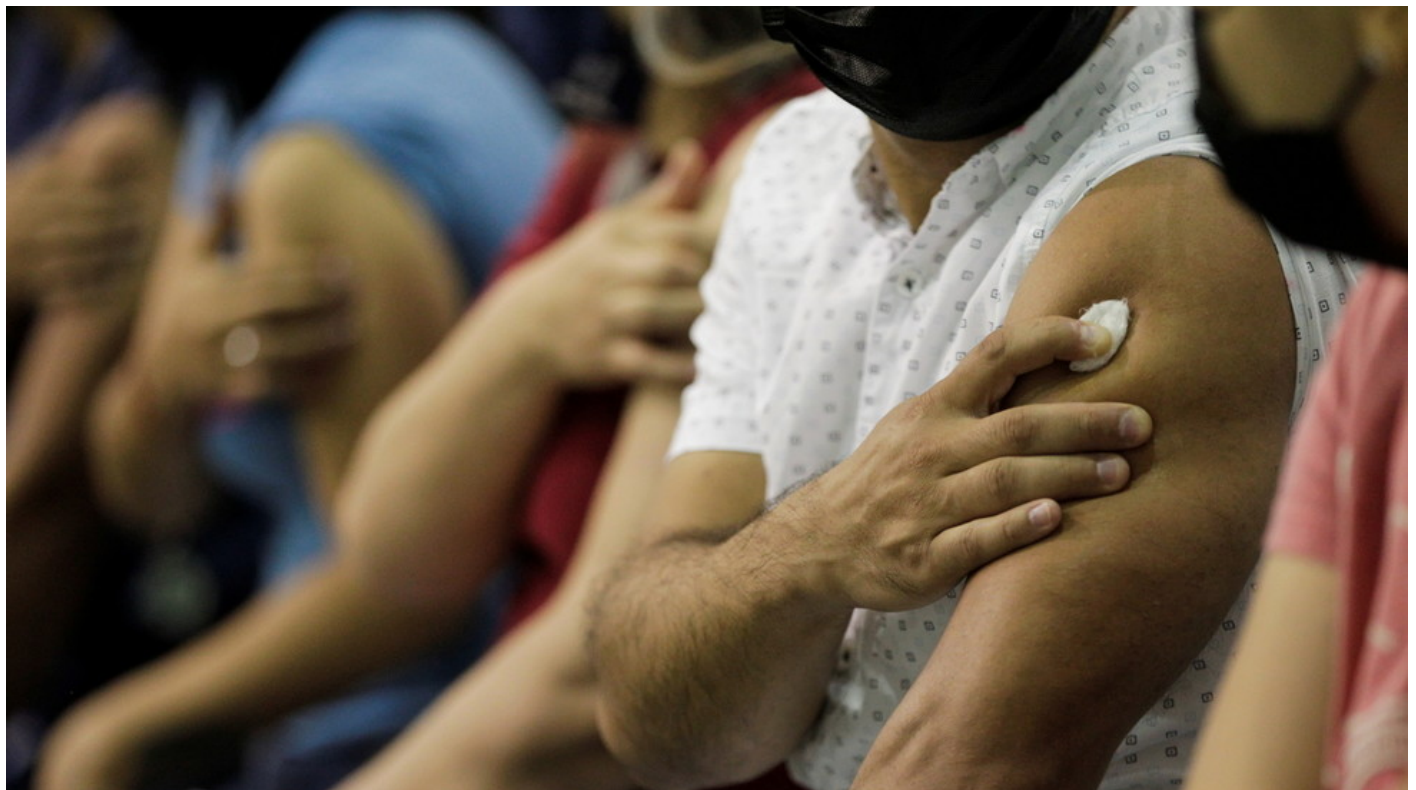
FILE PHOTO: Vaccination against coronavirus disease (COVID-19) in San Nicolas de los Garza, Mexico