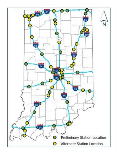
Strategic EV Charging Infrastructure Plan (INDOT)

The CPRG offers an opportunity for CIRDA and other regional stakeholders to plan for and implement these efforts, within the region's communities, and prepare for the economy of the future.