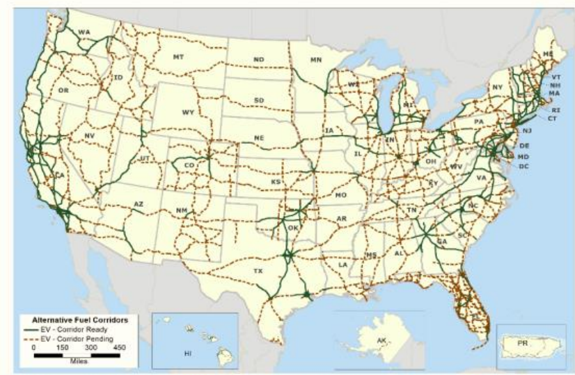
EV Alternative Fuel Corridor Designations, Rounds 1-6 - top