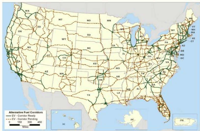
EV Alternative Fuel Corridor Designations, Rounds 1-6 - top