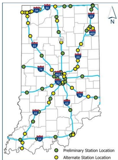
Strategic EV Charging Infrastructure Plan (INDOT)

The CPRG offers an opportunity for CIRDA and other regional stakeholders to plan for and implement these efforts, within the region's communities, and prepare for the economy of the future.