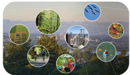
This silo-busting and multi-benefit approach informed the ROSS's Preliminary Comprehensive Strategy.

The White River ROI centered around one of the region’s greatest natural assets, the White River. This grant allows CIRDA to expand these efforts by creating a regional open space strategy that supports investments in protecting, enhancing, and increasing access to the natural environment. A plan should preserve and celebrate the spaces that provide recreation opportunities, tranquility, and connection to nature that make the region special for the people who call it home.