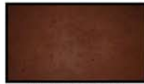
CR-202-32OZ French Roast