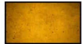
CR-211-32OZ Montana Wheat