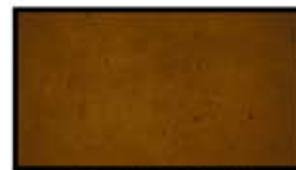
CR-214-32OZ Tuscan Brown