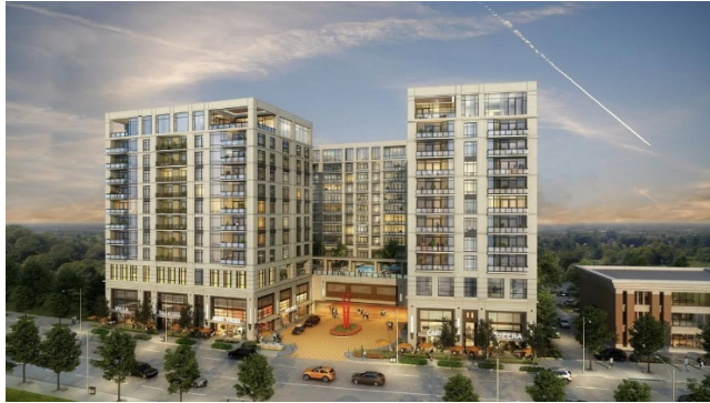
99 West Paces Ferry