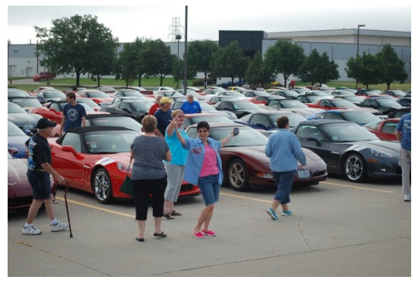
Cascade Corvette Club In Lincoln, Nebraska 2014

Among the items the Board will be discussing is some kind of "Reopening Celebration" this Spring. If you have an idea, please let a member of the Board know or plan on attending the Board meeting to share your thoughts. The Board meets April 6, 2:00 pm at Kendall Chevrolet.