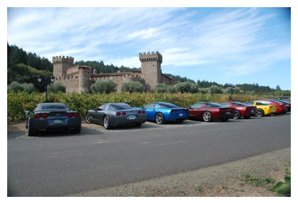
CCC & HDCC at Castello di Amarosa, Napa, CA 2013