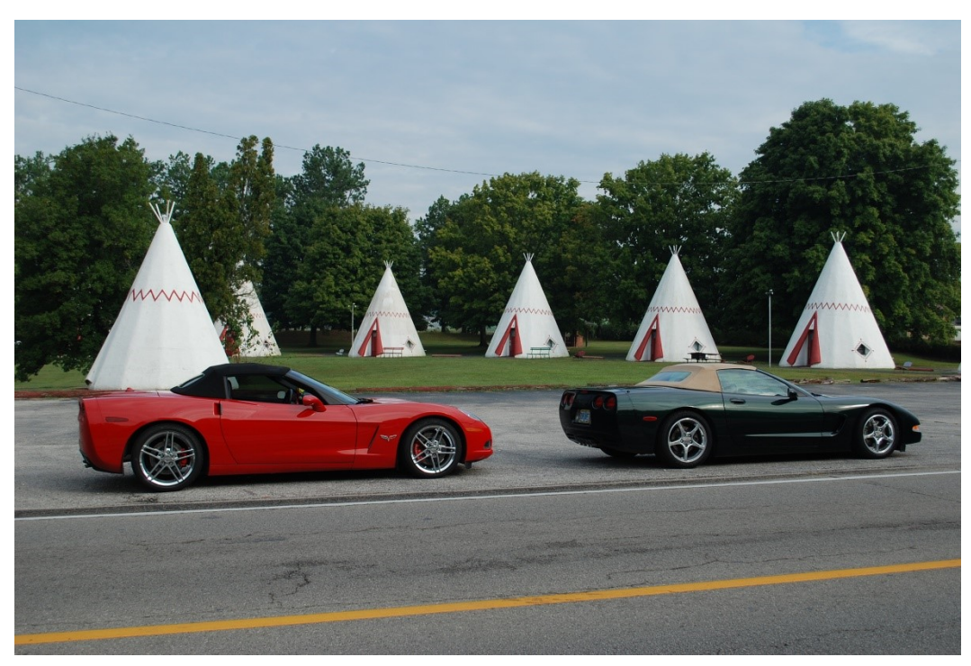
Wigwam Motel Cave City, Kentucky 2009