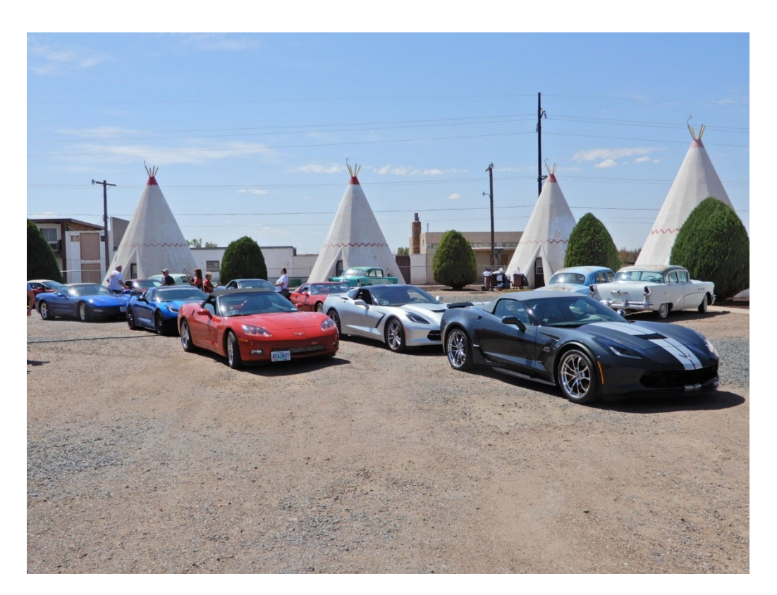
Wigwam Motel Holbrook, Arizona 2019