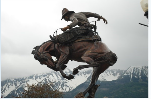
Joseph, Oregon 2016