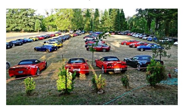
"Corvettes in the Park" 2017