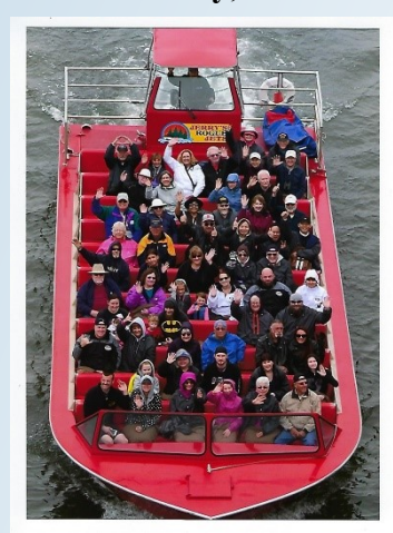
Rogue Jet Boats 2018

September 11 - 13 IMSA Weathertech Series Laguna Seca Monterey, CA