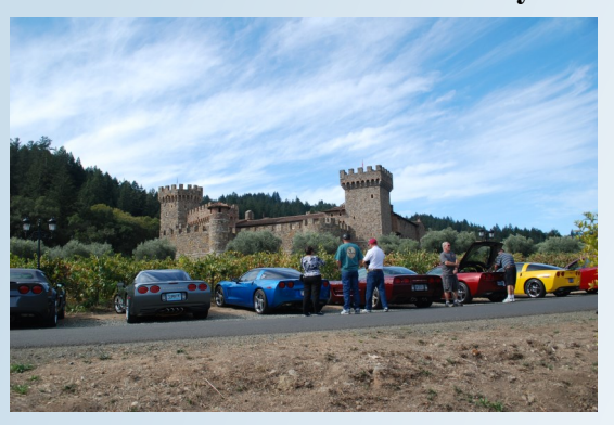
2013 - CCC in Napa, CA