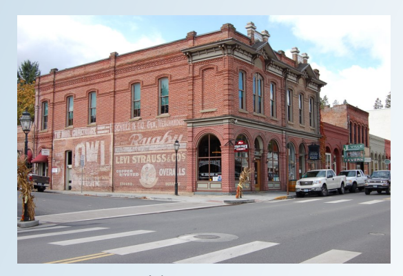
2007 - President's Mystery Tour to Jacksonville