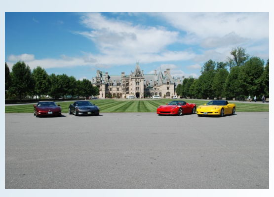
2014 - CCC at The Biltmore Estate, NC