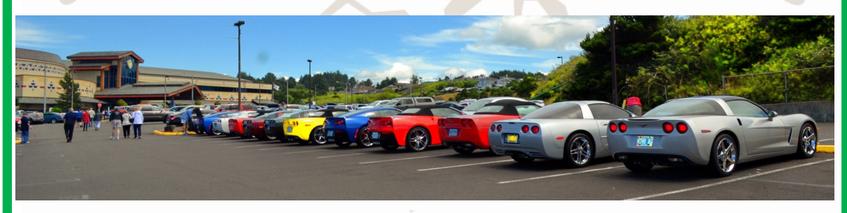
Casino Tour 2016