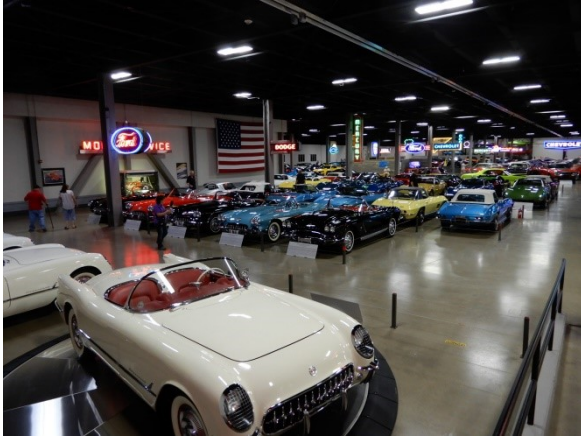
Like exotics? Got ‘em.

On August 1, several members of Cascade Corvette Club, along with members from several Salem car clubs were fortunate to tour the Brothers Car Collection. This collection has been “semi-secret” for many years and is just now beginning to open to groups of enthusiasts with reservations. I don’t want to spoil the experience for a second group going on August 22, so I will just say WOW and OMG !!