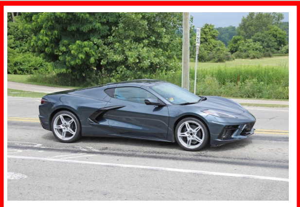
A Shadow Gray 2020 C8 Corvette

August 9 Meeting Our regular meeting night with a twist: Eat before or bring a picnic to Riverside Park in Harrisburg. Meeting time will be 7:00 pm