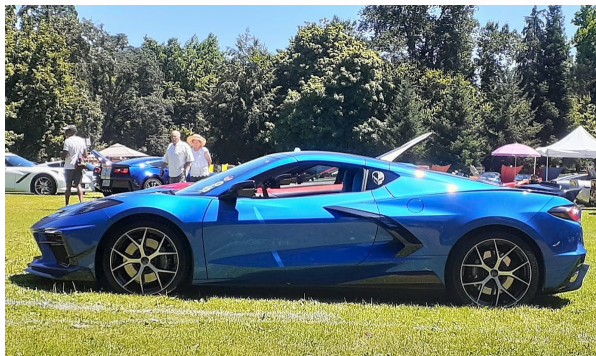
Stan & Shannon at “Corvette Weekend” in Grants Pass. They won Sponsors Choice, Best C8 and Best of Show !!

CCC at Cowboy Dinner Tree in Silver Lake, Oregon. Lots of food and laughs!