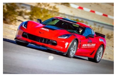
March 11-12: Spring Mountain Motorsports Ranch, Corvette Owners School.