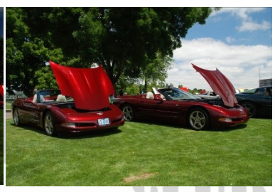
June: Corvettes on the McKenzie