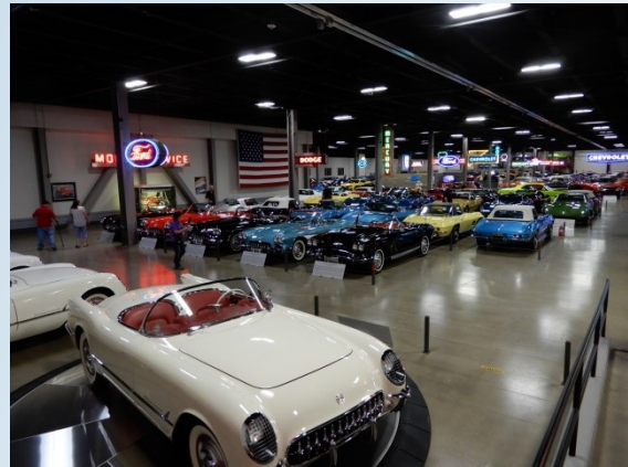
Corvette area at Brother’s Car Collection

This pit-stop in Montana is known as “Last Chance” - don’t believe it! There are much better stops just down the road.