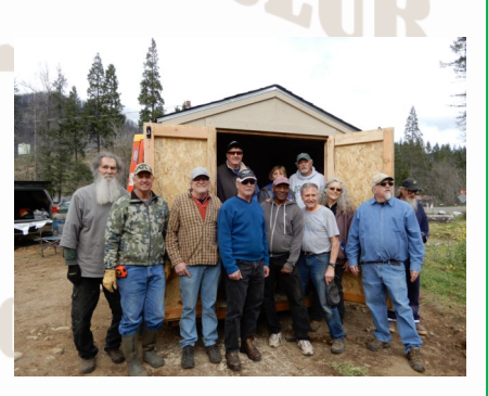
April - Cascade Corvette Club was blessed to be able to participate in the birthday