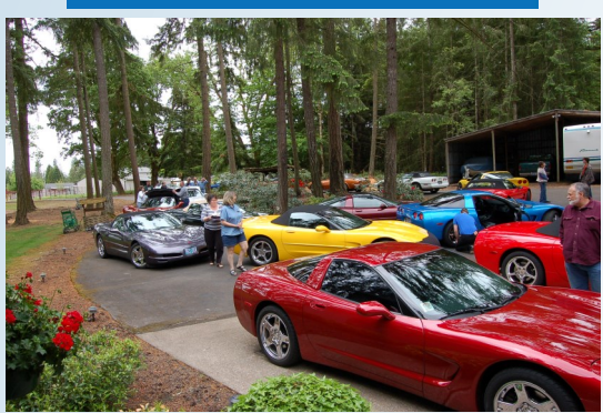
CCC Progressive Dinner 2008