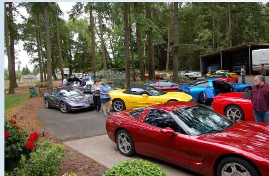
CCC Progressive Dinner 2008