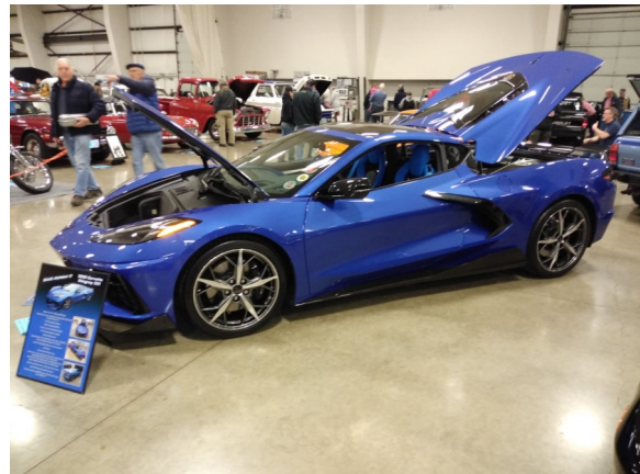
Stan & Shannon's 2020

All the Corvettes shown at the Winter Rod & Speed Show in Albany.