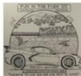
T Shirt Design