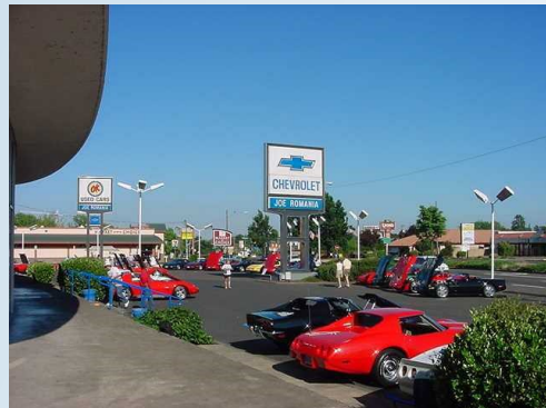
Joe Romania Show 2002