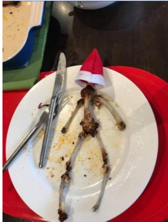
Tastes like chicken.....