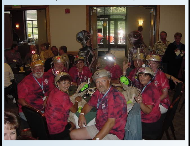
Winners of the costume contest at Vettes on the Rockies 2001

And the first Club Breakfast will be January 25, 8:30 am at the <u>new</u> IHOP at 3215 W. 11th Ave. (W. 11th & Seneca)