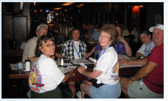
Club members in Nashville 1999