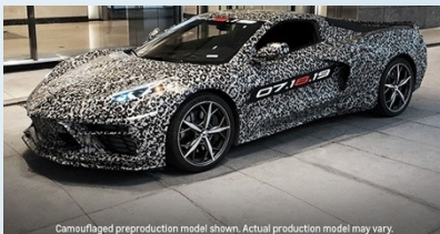
Camouflaged preproduction model shown. Actual production model may vary.

July 18 C8 Corvette Reveal (watch for streaming options)