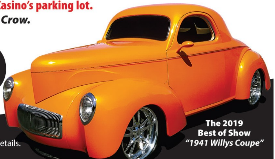
The 2019 Best of Show "1941 Willys Coupe"