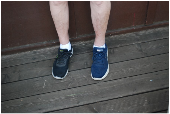
Someone packed in the dark.....