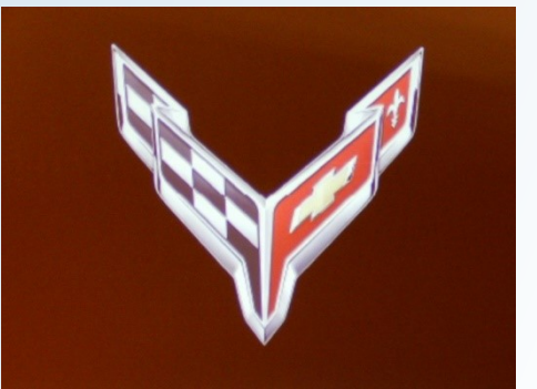
New C8 Crossed Flags Logo

August 28 - September 1, 2019 25th Anniversary Celebration National Corvette Museum Bowling Green, KY