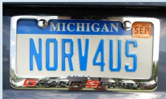
Seen at The Bash

July 13 3rd Corvette City Hosted by Timberland Corvette